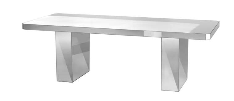
Table constructed in three mirror volumes: two bases and a top. The internal structure is in wood, painted metal grey. Each of the three elements is externally clad in natural mirror. Mirror edges all hand-made with gold detail.